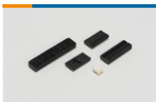
Wire-to-Board Connector Assemblies & Housings(25)